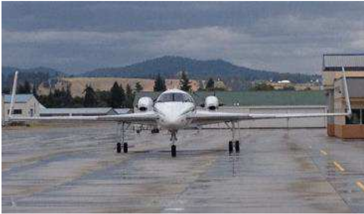
Notice the Canard in front and the "Pusher" propeller in back.

After dropping off Burt Rutan at COE on his way home from Oshkosh, this aircraft made a stop at Felts Field in July, and a few club members were lucky enough to see it.