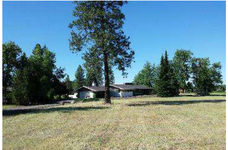
Above, the 2,250 square foot main house

Everyone who has been around Felts Field a while remembers the wonderful pot luck parties the Fowlers' used to have for EAA, WPA and the 99's. That home is now for sale. The estate includes 18 acres with a 2,250 square foot home, hangar, shop and artist's studio. It is about ten miles southwest of Spokane just off the Pullman highway. Right next to Homeport on your sectional.