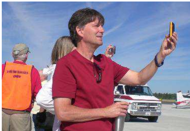
Proud papa takes movies of his Young Eagle