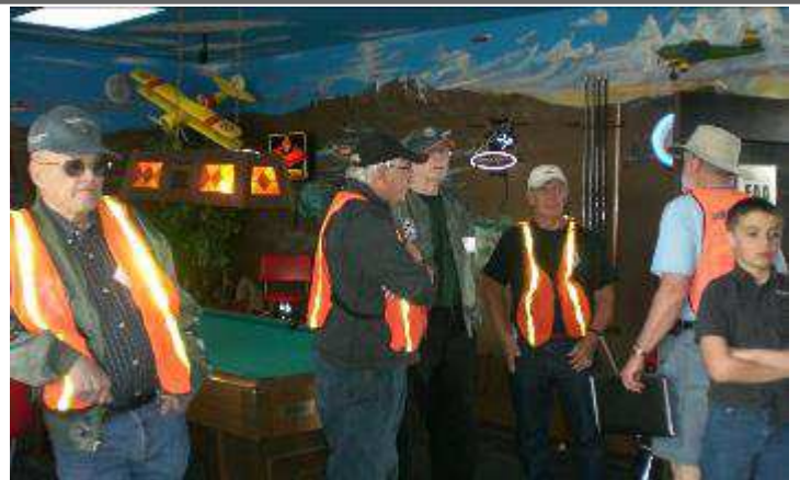
Young Eagles pilots and ground crew get briefing