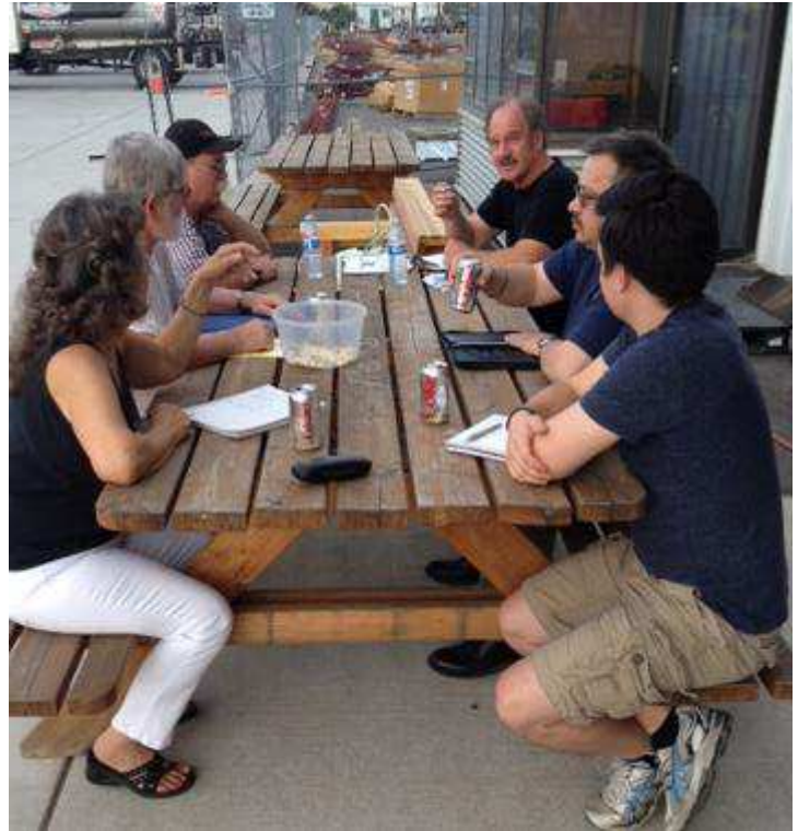
Your EAA 79 Board Members hard at work planning Neighbor Day, EAA B-17 visit and other fun activities.