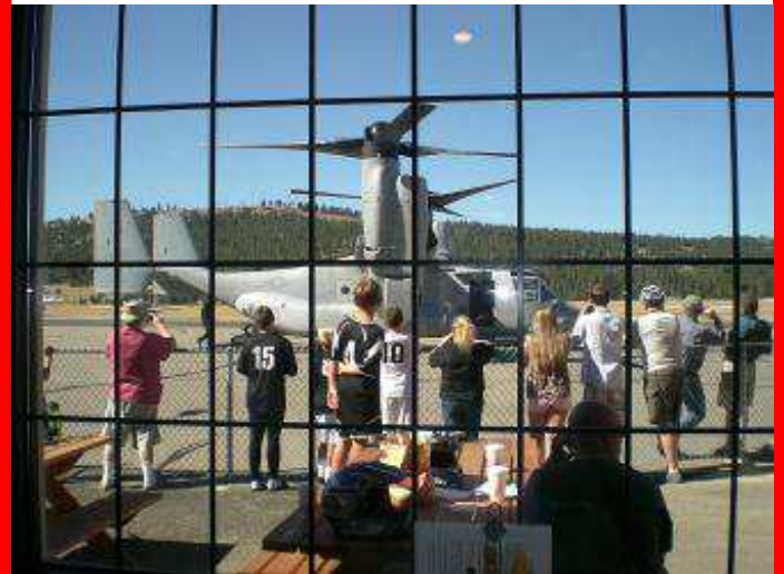
VIEW FROM THE SKYWAY

HOT AND FRESH HOMEMADE MEALS WITH LARGE PORTIONS, GREAT SERVICE, AWESOME FOOD AND SPECTACULAR VIEWS